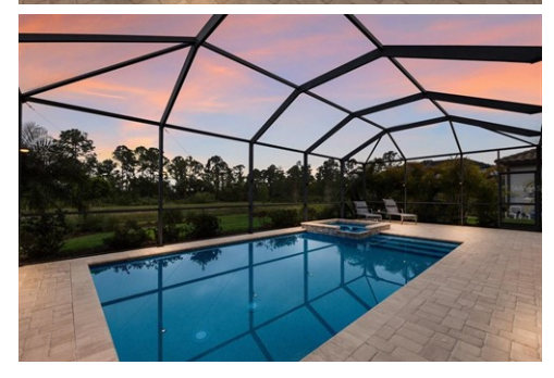
Michael Saunders & Company.

Sales Office 8325 Lakewood Ranch Blvd. Lakewood Ranch, FL 34202 (941) 907-9595